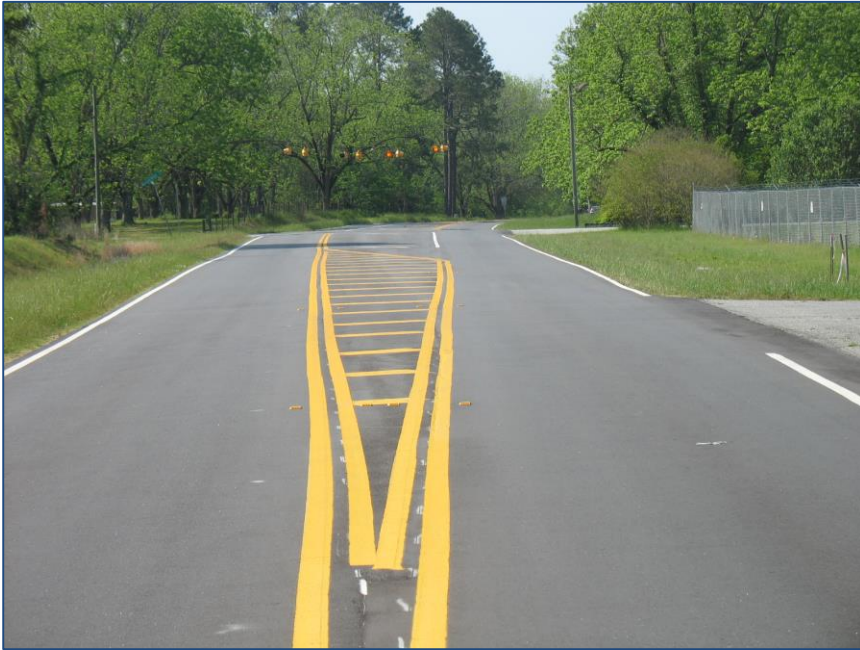
Radium Springs Road Dougherty County