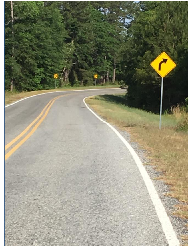
Buckhead Road Appling County